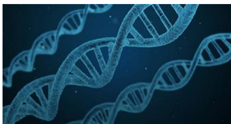
Image 1: DNA Strand

To understand how we apply this to healing, we need to look at how our thought patterns become crystallised into the body. Every sensory experience, thought and emotion produces an electrical wave which passes through every DNA molecule in the body. The structure of DNA is a spiral which turns back on itself and spirals back the other way, so any wave that passes through it will go both directions at once. The result is a scalar wave, an information wave that has no direction.